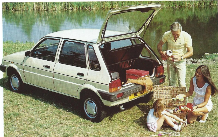
Metro L 5-door.

For economy plus gutsy action, go for the 3-door 72 bhp MG1300. Here is Metro practicality