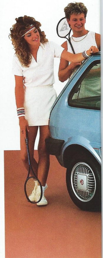
MG Metro 1300.