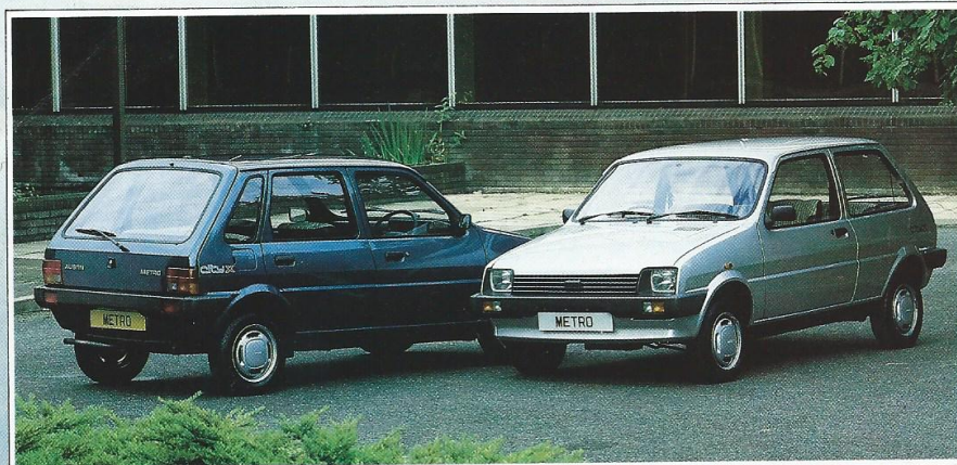
Metro City X 5-door and 3-door.

The spacious and very affordable 998 cc Metro City captures the Metro concept at once, its big windows giving 88% all-round vision. Hydragas