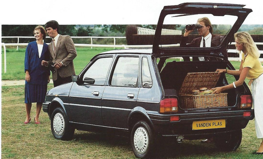
Austin Metro Vanden Plas.

Big item of Show news is the launch of five handsome Austin