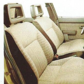
Austin Montego 1.6 L interior.

Adding further emphasis to the new higher specification levels across the Austin Rover range is a broader choice of exterior colours and a totally new selection of co-ordinated interior trim colours and materials. See them at your local Austin Rover showroom.