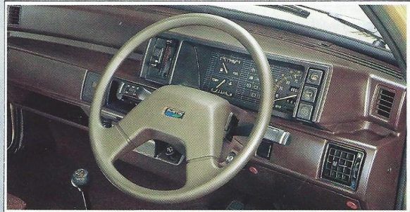
Metro 1.0L/1.3L fascia.

For outstanding fuel economy, consider the 3-door Metro 1.0HLE or the 5-door 1.3HLE, both with a "3 + E" gearbox and elegant tweed fabric seat trim.