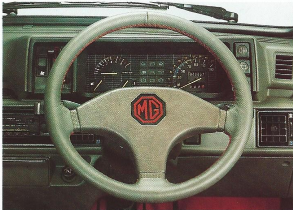
MG Metro 1300 fascia.

combined with an exciting sporting spec., including full instrumentation, sports seats and wheel, distinctive grey and red trim and radio/stereo cassette.