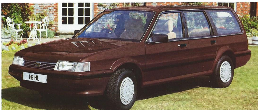
Austin Montego 1.6HL Estate.

With the introduction of the 1985 models, rear seat belts are available as an option on all derivatives that do not already have them as standard.