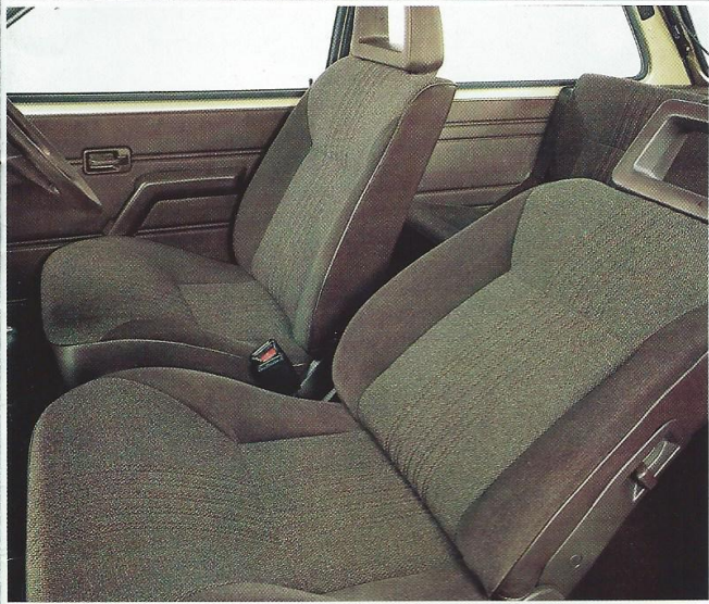
Metro 1.0L/1.3L Marle and Plain Velour trimmed seats.

Enter the Metro 1.0L and more powerful 1.3L, also available with 3 or 5 doors. Standard 'extras' include the famous 60/40 split rear seat, styled halogen headlamps and pushbutton radio.