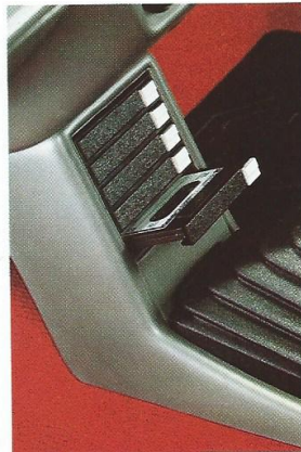
Centre console cassette storage (MG Metro 1300).