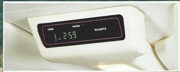
Roof mounted digital clock (HLE).