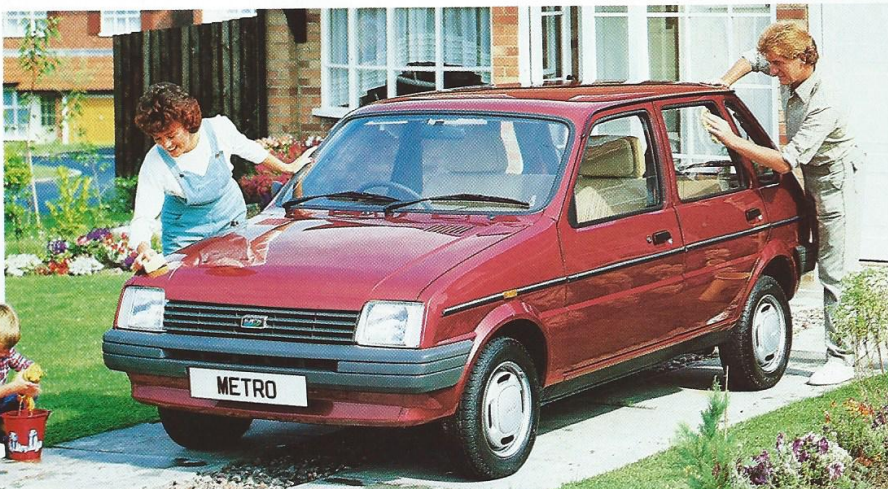
Metro HLE 5-door.