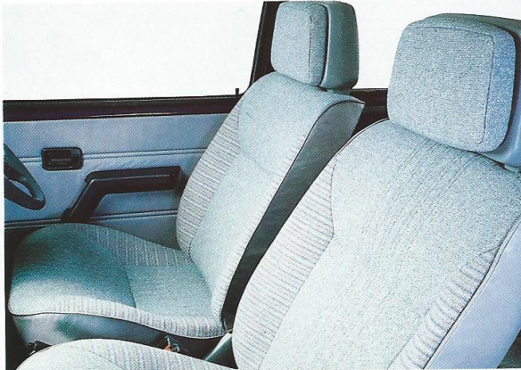
Metro HLE Plain and Moonstripe Tweed fabric trim.