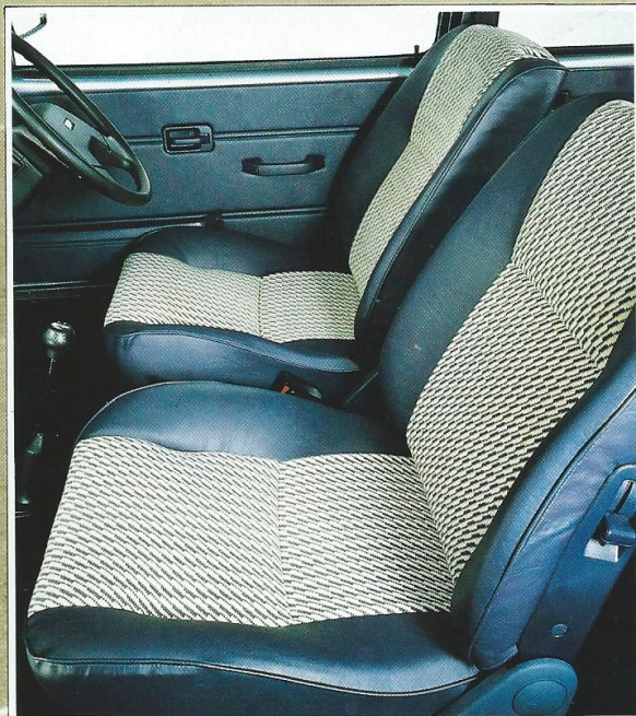
Metro City Sawtooth fabric trimmed seats

City X, with a little more urge, a lot more equipment and the important option of three or five doors.